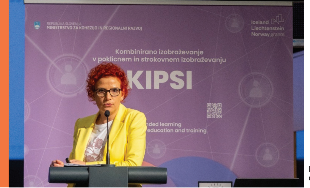
Digital and Innovative Conference